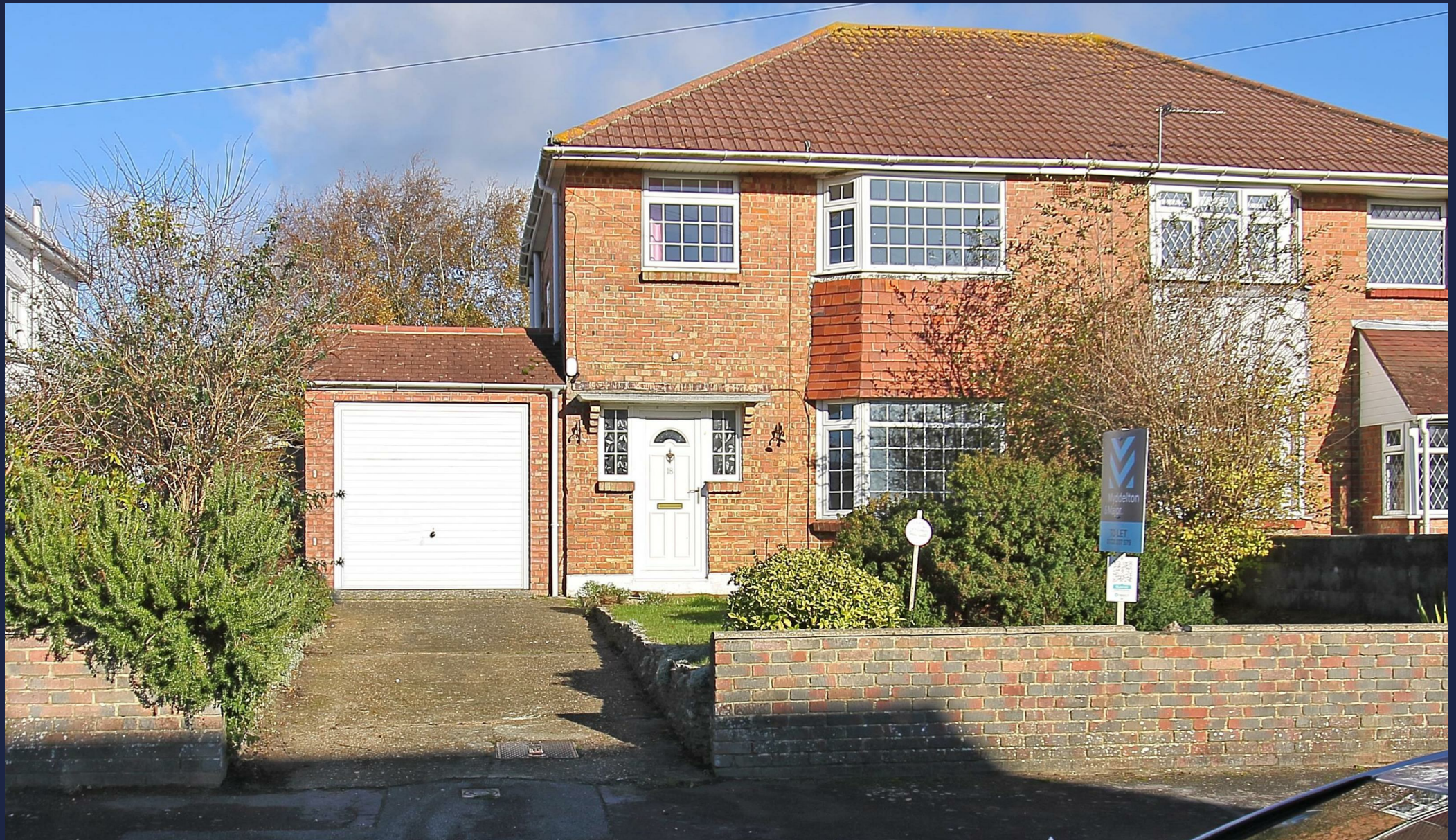
St Saviours, 18 Hillside Road, Poole